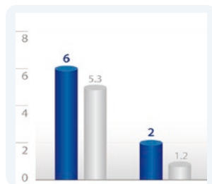
Tensile Strength Osscover vs Brand A