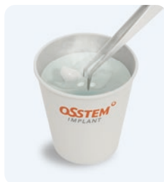
Soak in warm water