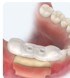
Apply into the mouth