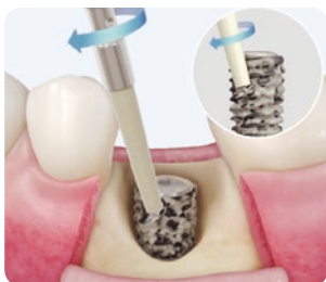
SmartBrush1: Used for dehiscence & horizontal bone loss