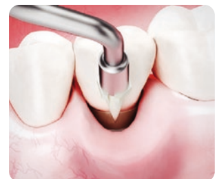
SmartScaler - Plastic: Removal of Peri-Mucositis