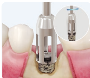
SmartBrush2: Used for vertical bone loss