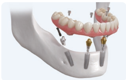
Effective stress distribution is achieved by the appropriate angulation of the implants