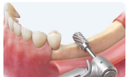
Creates a smoother crest surface for more stable drill guidance and predictable site preparation