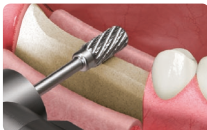
Net-shaped blades of the bur speeds up the ridge widening