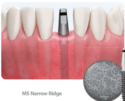
MS Narrow Ridge