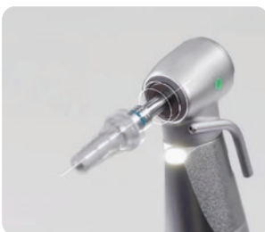
Outstanding chucking force, precise drilling and stable holding ability of the implant