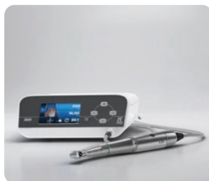
Outstanding quality for safe and secure surgery