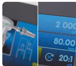
Precise overview can be checked with ease during the surgery on the LCD panel